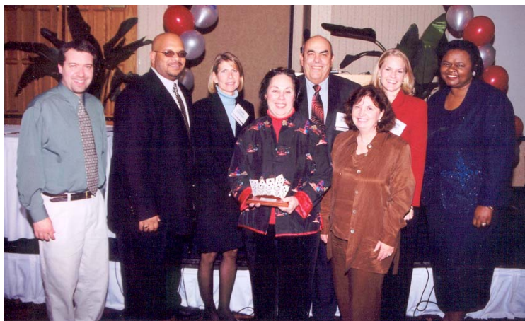
Staff and Board president accept the 2004 "Wellness Award" for the Wise Guys program.